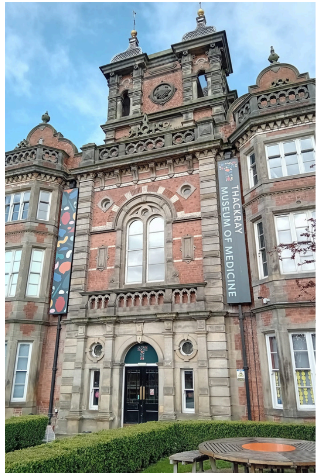
THE THACKRAY MUSEUM; FRONT PAGE: PHARMACY BOTTLES AT THE MUSEUM.