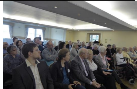
Part of Sunday's audience