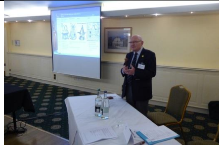
The President opened the proceedings