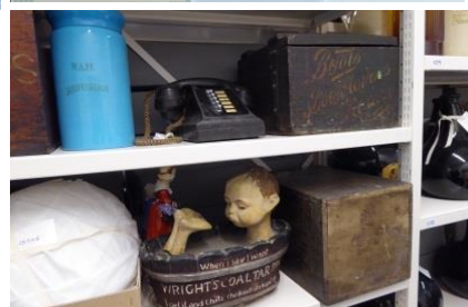
"When I say I want Wright's Coal Tar soap I get it, and that's the kind of chap I am"