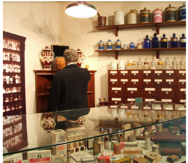
TOP & BOTTOM IMAGES: THE GEORGE MARSHALL MEDICAL MUSEUM IN WORCESTER.

Delegates are responsible for making their own accommodation bookings. Our suggested hotel is the Worcester Whitehouse in the city centre, where a number of committee members will be based.