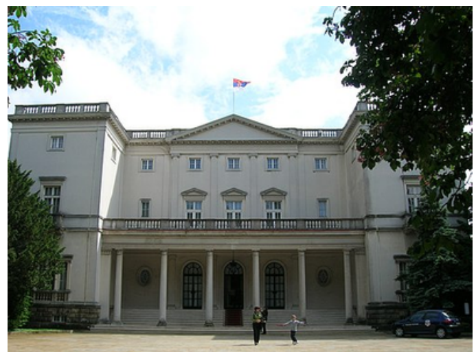
ABOVE: THE WHITE PALACE ( BELI DVOR ), BELGRADE. BELOW: THE PALACE INTERIOR.