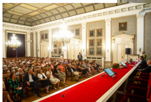
BELOW: THE OPENING CEREMONY OF THE 46TH INTERNATIONAL CONGRESS FOR THE HISTORY OF PHARMACY, BELGRADE