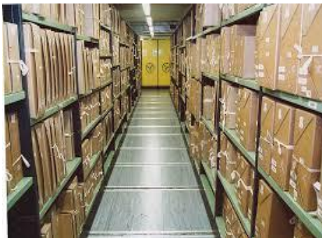
National Archive documents suggested for visit by the British Society for the History of Pharmacy on Friday 12 July 2019