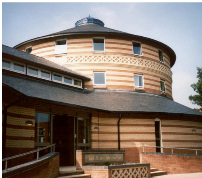
THE GEORGE MARSHALL MEDICAL MUSEUM IN WORCESTER.

Call for Papers & Posters: Perhaps you'd like to talk about past pharmacists' relationships with other health practitioners. You could investigate areas of overlap between historical pharmacy practice and other disciplines. Or you might have a case study where pharmacy history meets another field of study. You do not have to be an experienced speaker or seasoned researcher to take part - we are always very keen to support those new to pharmacy history.