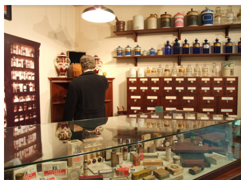
INSIDE THE MUSEUM.

Please contact conference organiser, Briony Hudson ( conference@bshp.org ), with a short outline of your proposed contribution (250 words) - or with any queries – by Friday 8 November 2024 .