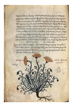
(Above) Glebionis coronaria from De Materia Medica from 10<sup>th</sup> Century, by courtesy of Morgan Library MS 652.