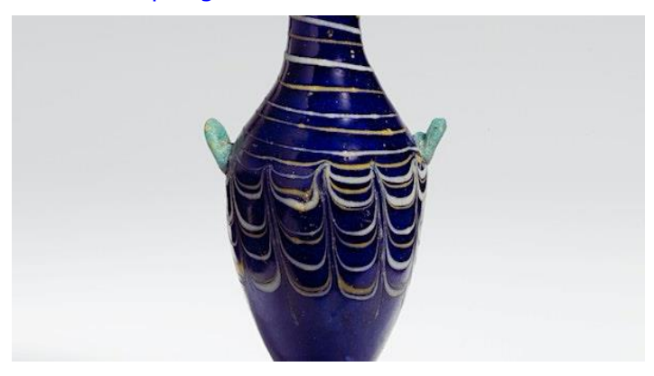
(Above) Glass unguentarium (perfume bottle), 3rd century BC, Gift of J. Pierpont Morgan, 1917.

Later in 2023 we will start a series on colonial pharmacy. Dates and further information will follow using email, our website and social media. Please email any questions about the talks to <a href="https://honsec@bshp.org">honsec@bshp.org</a>